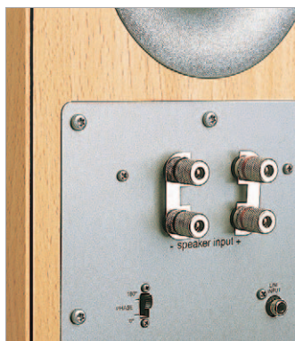
▶ High-quality binding-post connections on the speakers