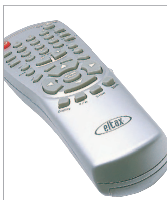
▶ Nicely sculpted, clearly labelled and sensibly laid-out